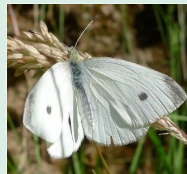
Cabbage White Butterfly